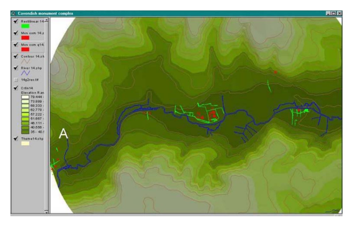
Figure 4, use of a Digital Terrain Model by Essex and Suffolk HERs: part of the Stour Valley with cropmarks

Most HERs will retain IPR and copyright over their data, but arrange for licensing for its use. Terms of licences may differ and will relate to the end product of a research project i.e. its publication and dissemination. Acknowledgement of the HER as a source will normally be required, and links the HER or service website if appropriate.