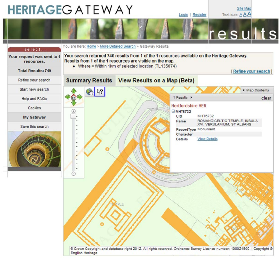
Figure 5, display of HER data on the Heritage Gateway website, Hertfordshire HER

advise on general approaches to HER data as well as strategies for engaging with the HER community. Researchers planning substantial projects should consider building in costs for ALGAO support, advice and attendance at board or steering group meetings etc. However it should be noted that ALGAO has no authority to agree terms on behalf of HER officers, who will be bound by policies and procedures within their own organisations.