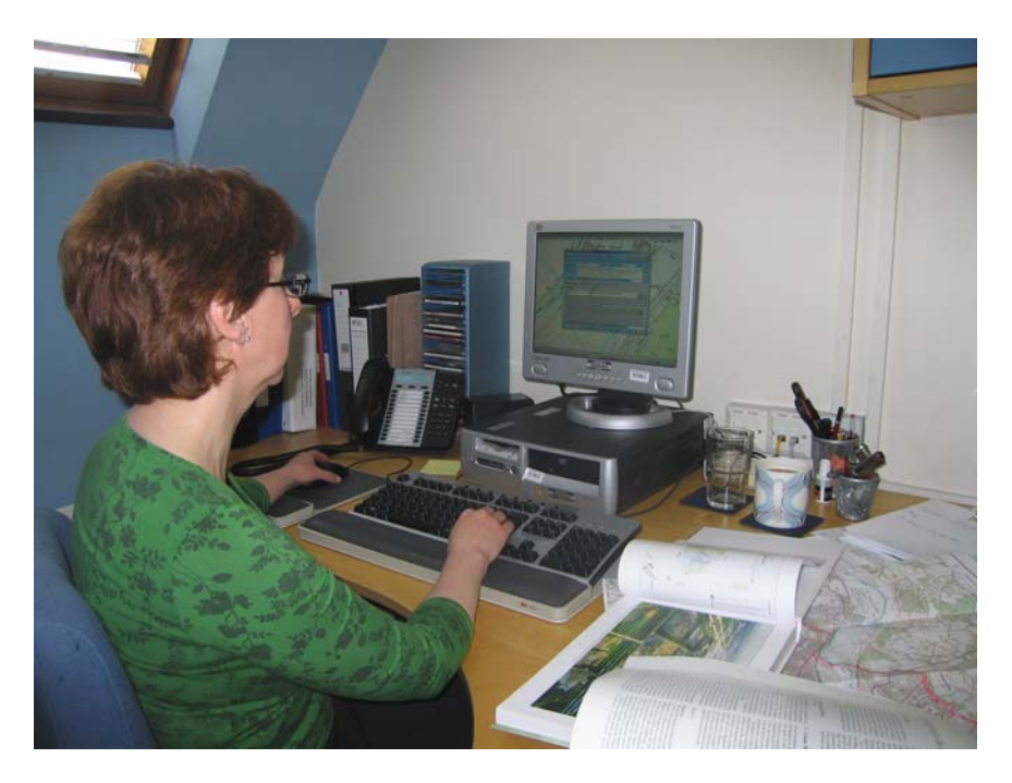
Figure 1, entering data onto a Historic Environment Record: East Berkshire HER

HERs provide an important starting point for almost all archaeological research in England. They are sophisticated information systems that comprise databases linked to a geographic information system (GIS), and associated reference material, together with a dedicated specialist staffing resource. Current Government policy in The National Planning Policy Framework defines HERs as " information services that seek to provide access to comprehensive and dynamic resources relating to the historic environment of a defined geographic area for public benefit and use " (2012, 52). HERs are used as the basis for historic environment conservation and management advice (e.g. for planning proposals and environmental grant schemes to farmers) as well as providing a valuable resource for education and research. There are over 80 HERs in England, giving national coverage comprising over 1.5 million sites. Contact details for all HERs in England are available on the Heritage Gateway website (see below).